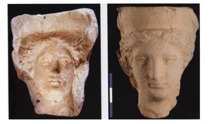
From Cyrene. Mold for the head of a woman and a modern cast.

In particular, the extramural sanctuary of Demeter and Persephone holds significant promise for future coroplastic research. Unfortunately, over the last 30 years political tensions between the United States and Libya prevented continued exploration of the sanctuary and further seasons of study of the finds. However, with the establishment of the new regime it is hoped that work at the sanctuary can resume and the study of the terracottas from the 1969 to 1979 seasons can be brought to completion.<sup>17</sup>