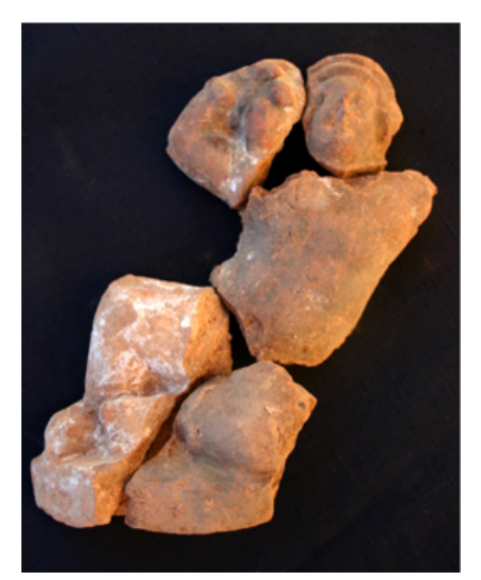
From Apollonia Young boy holding grapes.