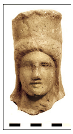
Terracotta figurines from the Extramural Sanctuary of Demeter and Persephone at Cyrene. Above: head of a woman, broken from a seated figure (CAM 77-815); right: standing woman with fruit and wreath (CAM 74-234).

This is a very exciting time for coroplastic studies for Greek and Roman Libya, and in particular for those from Cyrenaica. Libya is a relative newcomer to the field of coroplastic studies and, until the last 30 years of the 20<sup>th</sup> century, presented a barren field for coroplastic research. That coroplastic production was an active part of the ancient Greek religious, social, economic, and industrial landscape in Cyrenaica never was in doubt, for anyone who cared to look. Hellenistic terracottas had been recovered in sizable numbers from Cyrenaican tombs that had been looted over the course of the 19th century and comprise some of the oldest collections at the Louvre Museum, the National Archaeological Museum in Madrid, and the British Museum, among others.1 Yet they received very little attention for almost 100 years.